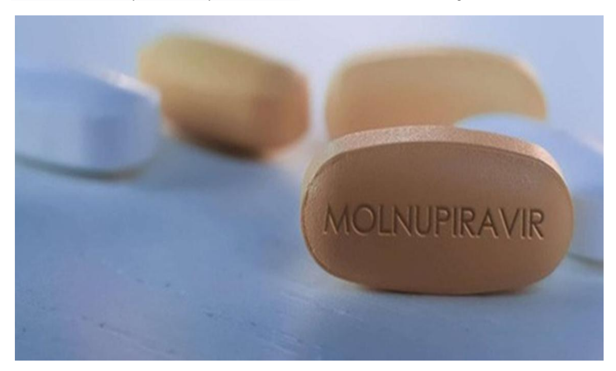
Fig. 2. Testing medicine molnupiravir for corona patients

We introduce this method as in Vietnam case, doctors are testing it: