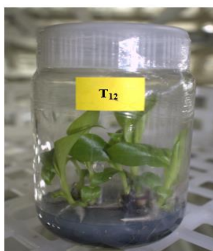
Fig. 2. Multiple shoots produced from explant cultured on MS medium supplemented with Ascorbic acid 200 mg/l + BAP 2.5 mg/l + Kinetin 2.0 mg/l