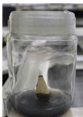
T 12 - Minimum browning