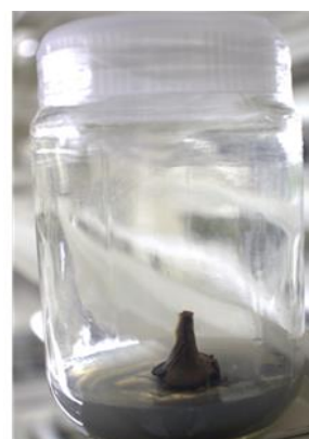
T 1 - Maximum browning