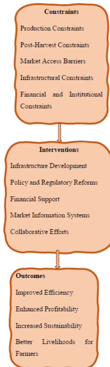
Fig. 2. Overcoming Challenges to Enhance Agricultural Outcomes