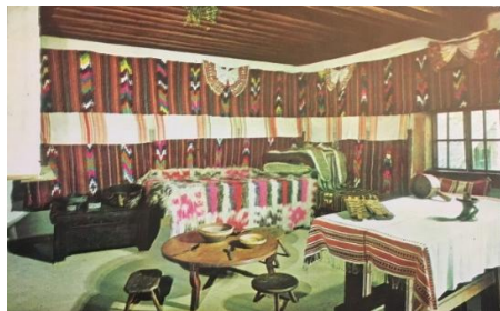
(a) interior view, distant plane, without other applied philatelic elements [30]