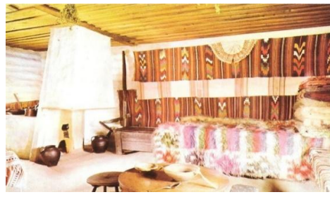
(b) interior view, distant plane, without other applied philatelic elements [31]