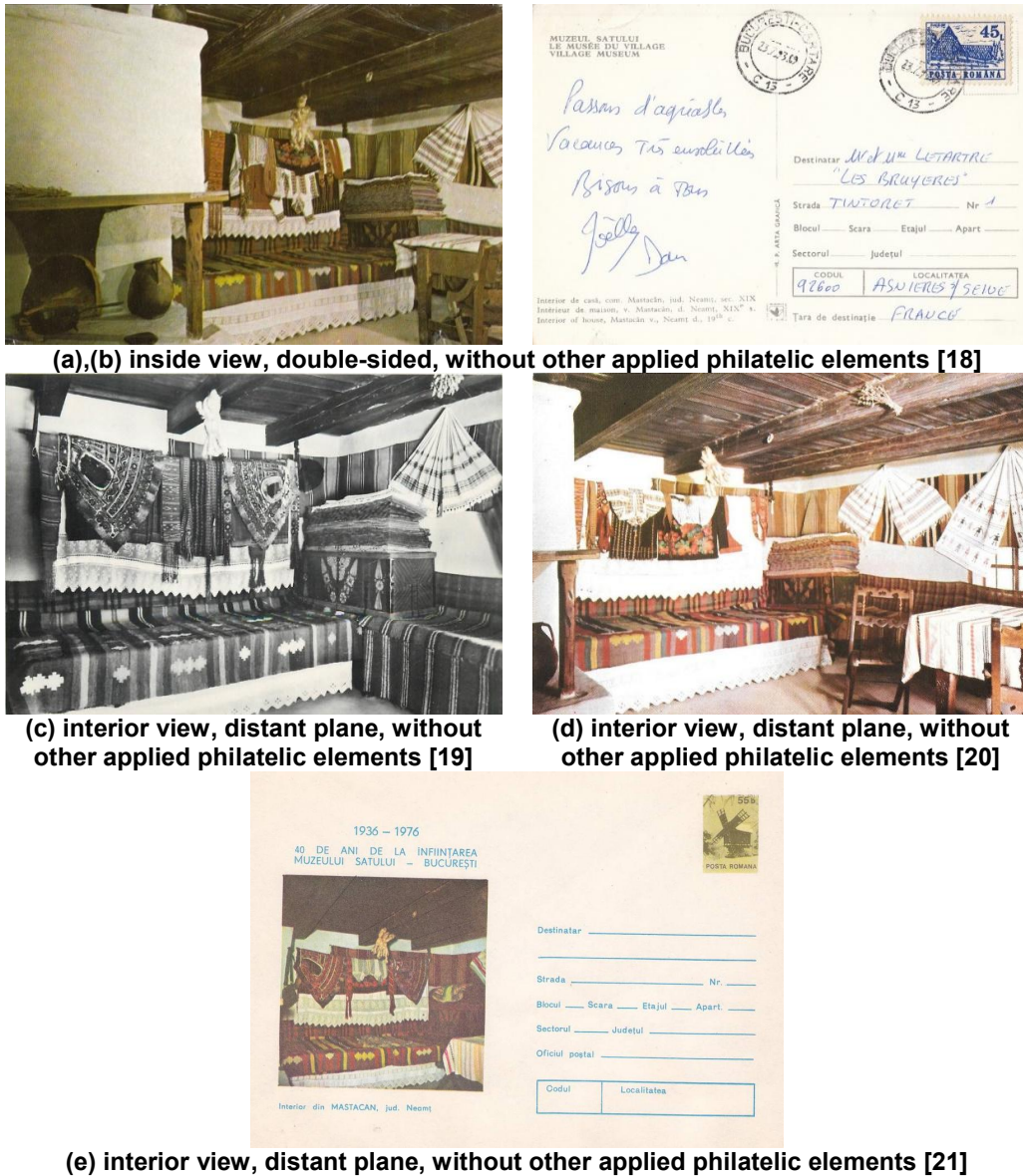
Fig. 3. Illustrated postcards representing the interior of the household from Mastacăn (Neamț)