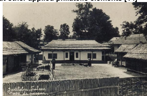
(d) exterior view, distant plane, without other applied philatelic elements [15]