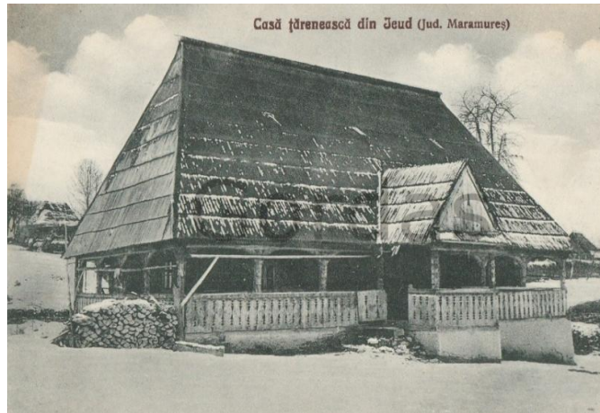
Fig. 1. Illustrated postcard representing the exterior of the household from Ieud (Maramureș)