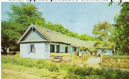
(e) exterior view, distant plane, without other applied philatelic elements [16]