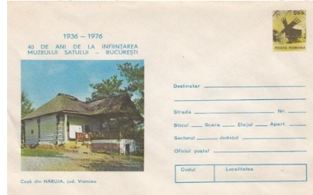
(d) exterior view, distant plane, without other applied philatelic elements [29]