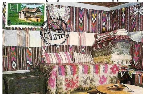
(c) interior view, distant plane, bearing the stamp with a face value of 5 lei from the philatelic issue "Traditional Architecture" and the first-day of issue stamp [32]