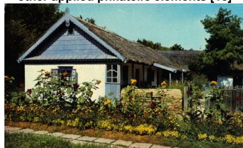
(f) exterior view, distant plane, without other applied philatelic elements [17]