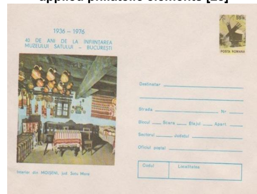
(c) interior view, distant plane, without other applied philatelic elements [25]