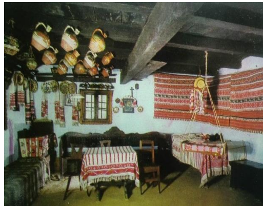
(b) interior view, distant plane, without other applied philatelic elements [28]