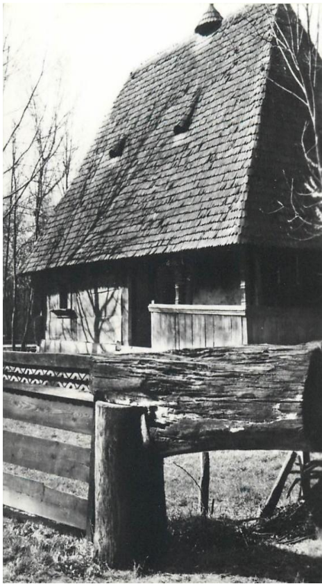
(a) exterior view, distant plane, without other applied philatelic elements [23]