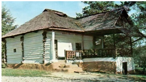
(a),(b) exterior view, double-sided, without other applied philatelic elements [27]