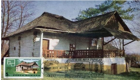
(c) exterior view, distant plan, bearing the stamp with a face value of 5 lei from the philatelic issue "Traditional Architecture" and the stamp of the Philatelic Exhibition "Architecture and traditional costume" from 25.09.-05.10.1989 and the day stamp, 30.09.1989 of Postal Office no. 32 from Bucharest [28]